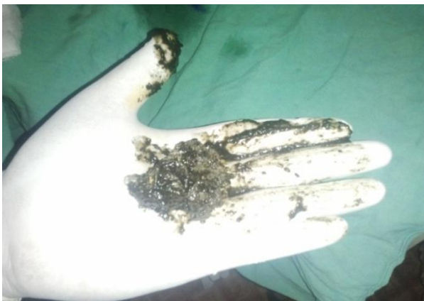
Figure 3: Tilkalkamadhusarpi Varti