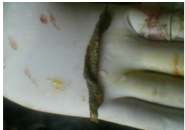
Figure 4: H2O2 Betadine Varti