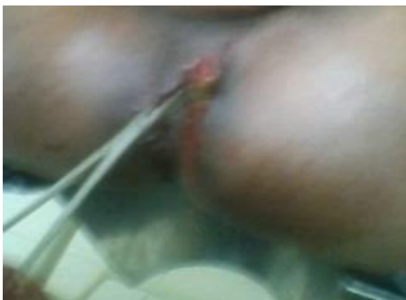
Figure 5: Perianal Abscess I&D