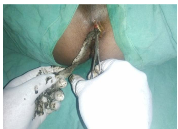
Figure 6: Insertion of Varti