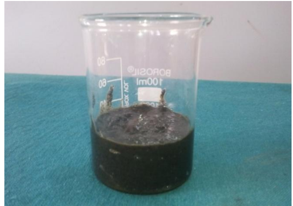
Figure 2: Tilakalka