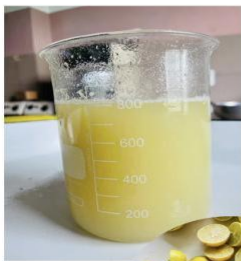
Fresh Lemon Juice