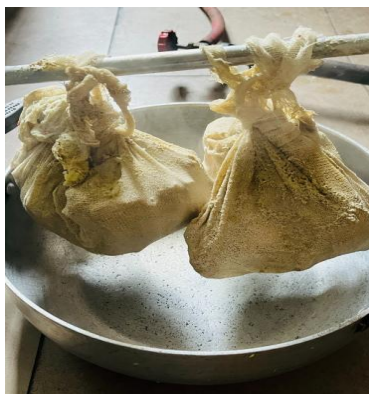
Pottali Containing Shuddha Shankha