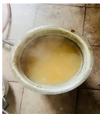
Lemon Juice Turned Turbid After Shodhana