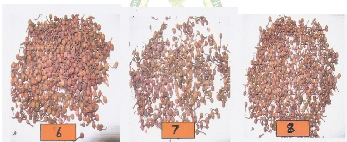
Fig. 2: Shows details of other three samples where Sample - 6 represents Kolkata sample, Sample -7 is of Haridwar and Sample -8 is of Lucknow