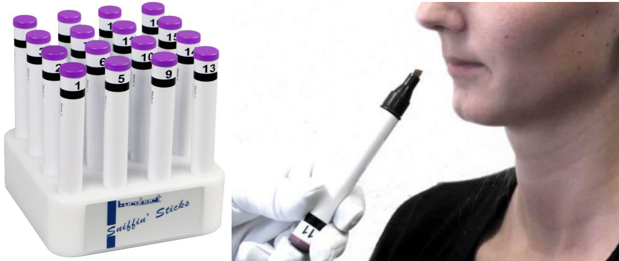
Image of sniffing sticks and the procedure